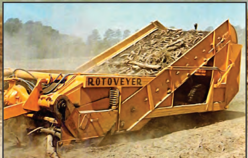
CARLISLE LAND CLEARING MACHINE IN ACTION